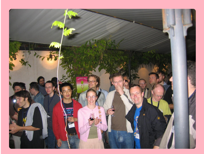
Happy people at today's party