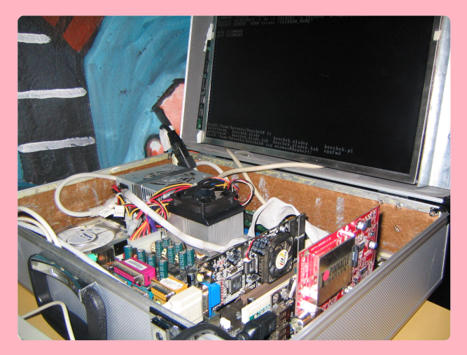
Our streaming suitcase